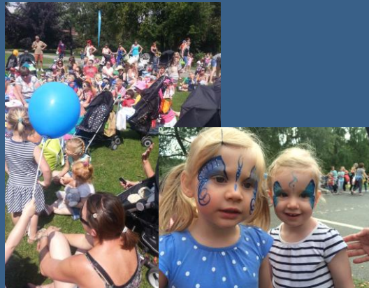
Family Fun Days are back! Every Friday across Brentwood!